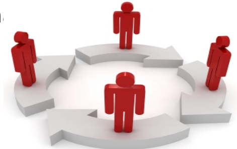
Workflow & Collaboration