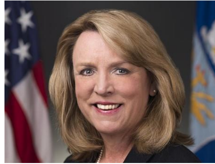
Hon. Deborah Lee James Commission Co-Chair