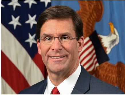
Hon. Mark Esper Commission Co-Chair